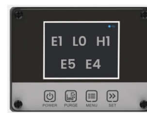
Automatic Faulty Detection