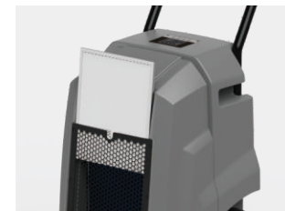
Quick Access Change Filter