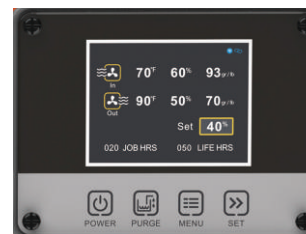
Easy to Control Panel