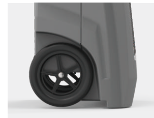
Two Big Rubber Roller