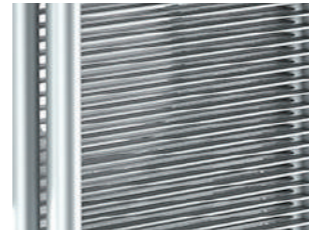
Microchannel Condenser Technology