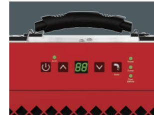
Ease Touch Button Control Panel