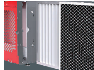
Merv-10 & Merv-1 Filter