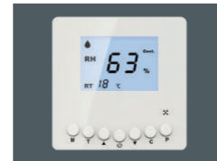
Optional Remote Control