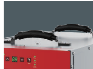
Ridged Handle for Easy Transport