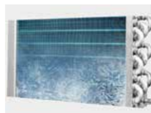
Automatic Defrosting System