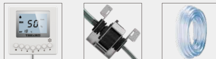
Optional Remote Control Condensate Built-in Pump Winkle Free Tube