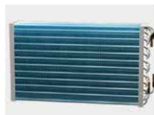
Rare Earth Alloy Tube Evaporator