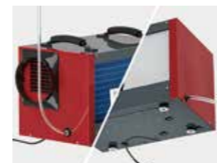
Pump drain / Gravity drainage