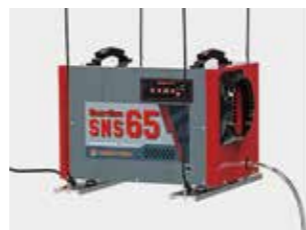
Optional Hanging Kits