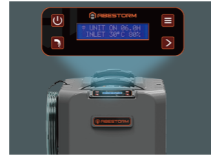
Easy to Operate Control Panel