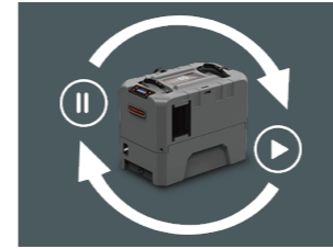
Automatic Humidity Control