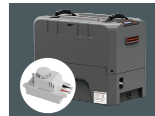
Internal Condensate Pump for Effortless Drainage