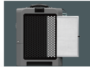
Easily Removable and Washable Filters