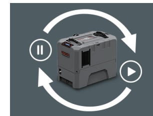
Automatic humidity control