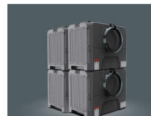
Ultra Portability, Stackable Design