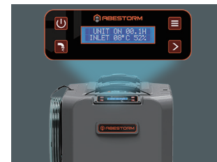
Easy to operate control panel