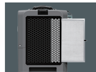
Easily removable and washable filters