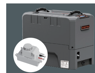
Internal condensate pump for effortless drainage