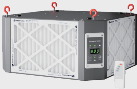
DecDust 1350IG Gray (Built-in Ionizer)