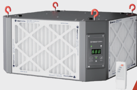
DecDust 1350 Gray